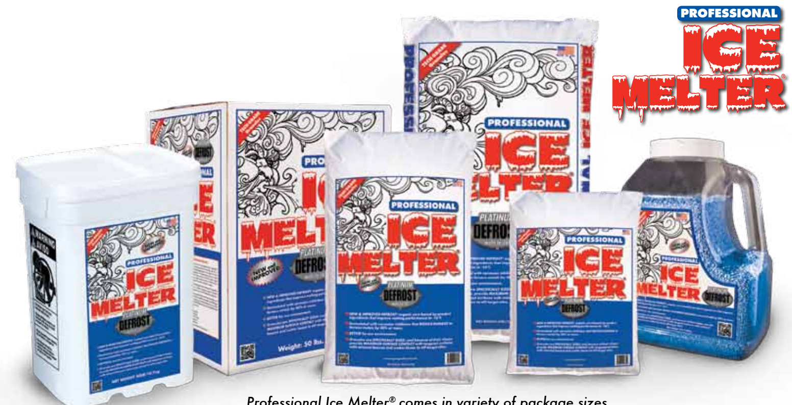
Professional Ice Melter® comes in variety of package sizes. 10lb., 20lb., and 50lb. bags, a 40lb. tub, a 9lb. jug, and a 50lb. box.